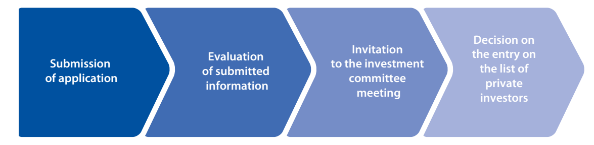
Figure 2: Selection process of private investors that may then request co-investment with the fund Koinvesticinis Fondas

As mentioned, only the selected private investors may submit a request for co-investment. An SME cannot send a direct request. This selection follows specific terms. If the private investor meets these requirements, the Investment Committee decides on the entry of the applicant to the 'list of private investors' on the basis of its assessment of the application. This selection is an ongoing process which will continue until the end of the investment period (expected for 31 December 2020, and can be extended). It is illustrated by the figure below.