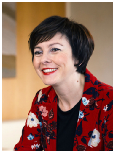
Ms Carole Delga