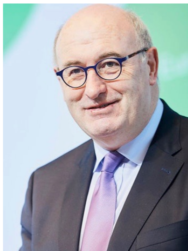
Mr Phil Hogan

European Commissioner for Agriculture and Rural Development